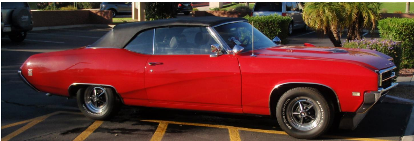
Mike Wolf's 1969 GS 400

I bought the 1969 GS 400 red convertible in January 2011 from a dealer in Santa Monica California. I drove out there, saw it and instantly fell in love with it. They shipped it by trailer; (The trailer was used to ship high end Italian sports car) it was all by itself in that trailer.