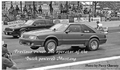
Previous owner and operator of the Buick powered Mustang

Turbos - Injectors - Upgrades Downpipes and Custom Downpipes FAST and BIG STUFF Tuning Motors