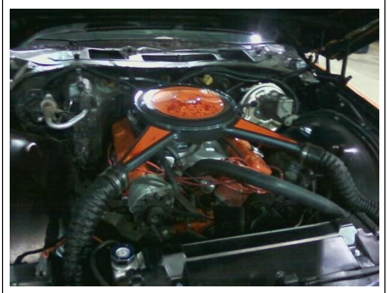
He's thinking about racing the car in a few years after the "new-ness" wears off. Right now the car is being used as a promotional tool for his company Mag-Daddy (an automotive fastener Continued on page 3

Magnaflow 100% Stainless Steel 4x9x14" muffler, TRU-X 2.5" tubing, dual exhaust, 2.5" turndown tips, Crossmember back, rear exit.