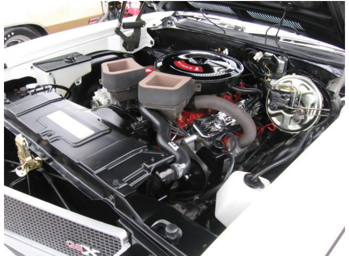
Above the GSX under transport and a picture of the under hood details