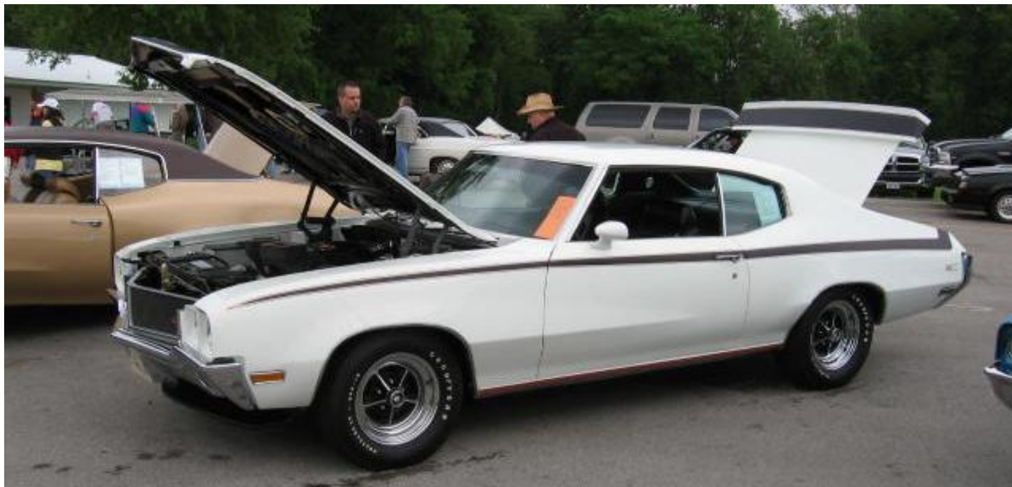
Joe Pratt's 1970 Apollo White Buick GSX

Volume 15 Issue 3 Winter 2009 Chapter of the Gran Sport Club of America ; 625 Pine Point Circle; Valdosta, GA 31602 912-244-0577