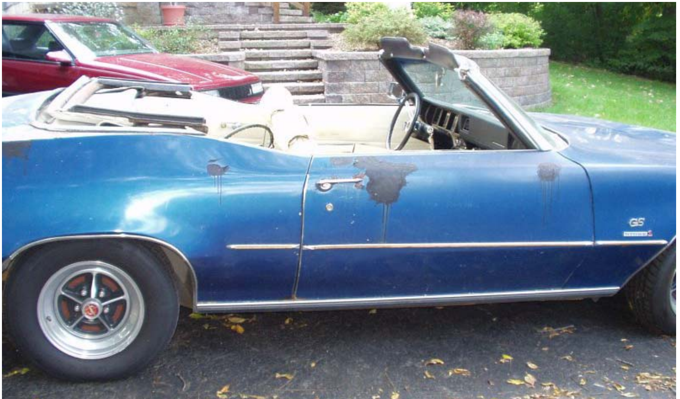
Bill had the vision to see the beauty in this

On a quick look, it had several options that seemed nice, bucket seats with the auto console. It had a big block motor but the holley carb on top had been through at least one carb fire. The paint was blue but there was not a bit of shine left in it. It had Stage1 emblems on both sides but they were clearly not in the correct positions. And the original white top was now a nice dark gray with several rolls of duct tape on the corners. A bit more digging below some boxes also revealed a large dent in the upper trunk corner that looked like a bowling ball had hit it from about 20 feet high. It was clear this was going to be a project. Not that I was deterred. But it made a big difference in the price I was willing to pay. I thanked him and told him the price I was willing to pay if his out of state bidder fell through. Less than two weeks later, he called back and said he was on his way over to my house with the car. I didn't ask any more questions. It showed up on a flat bed and I was the now the owner of a third Buick