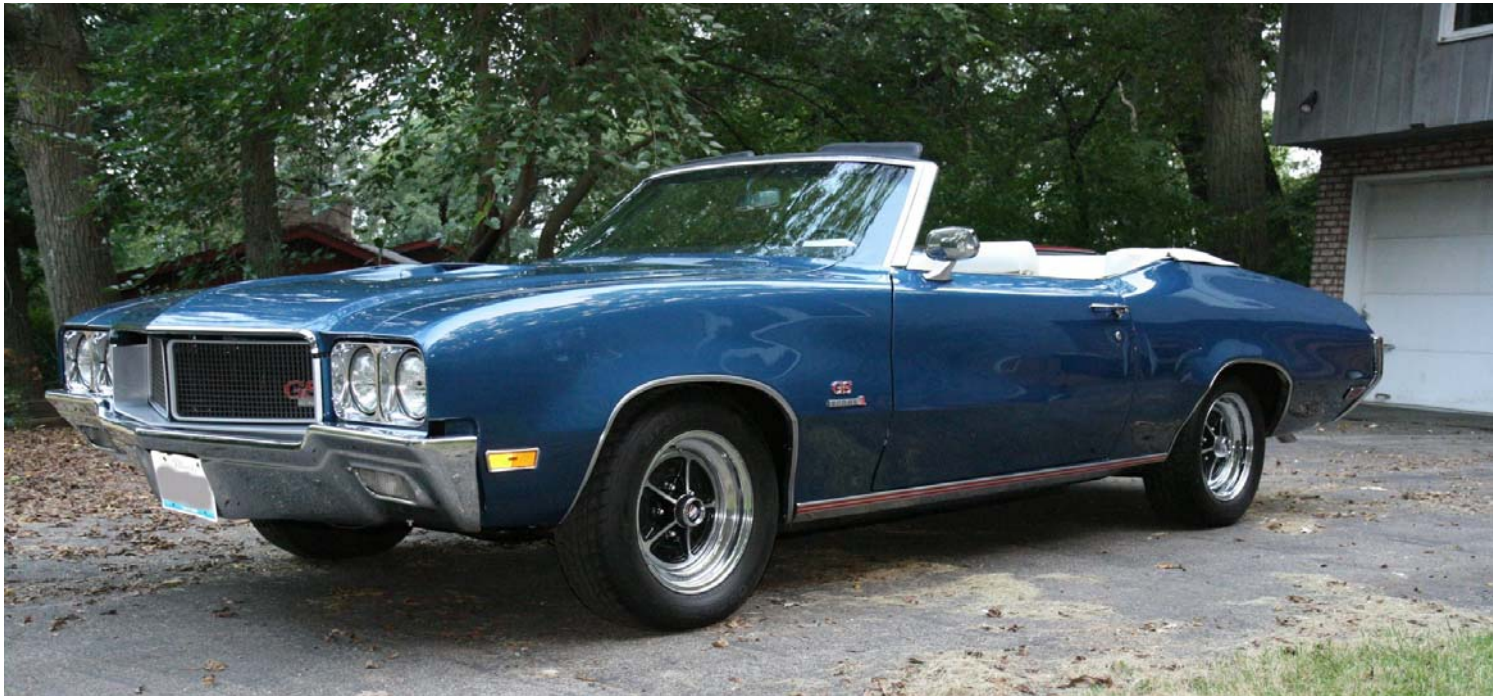
Bill Grupp's 1970 GS Stage 1 Convertible

Volume 14 Issue 2 Summer 2008 Chapter of the Gran Sport Club of America ; 625 Pine Point Circle; Valdosta, GA 31602 912-244-0577