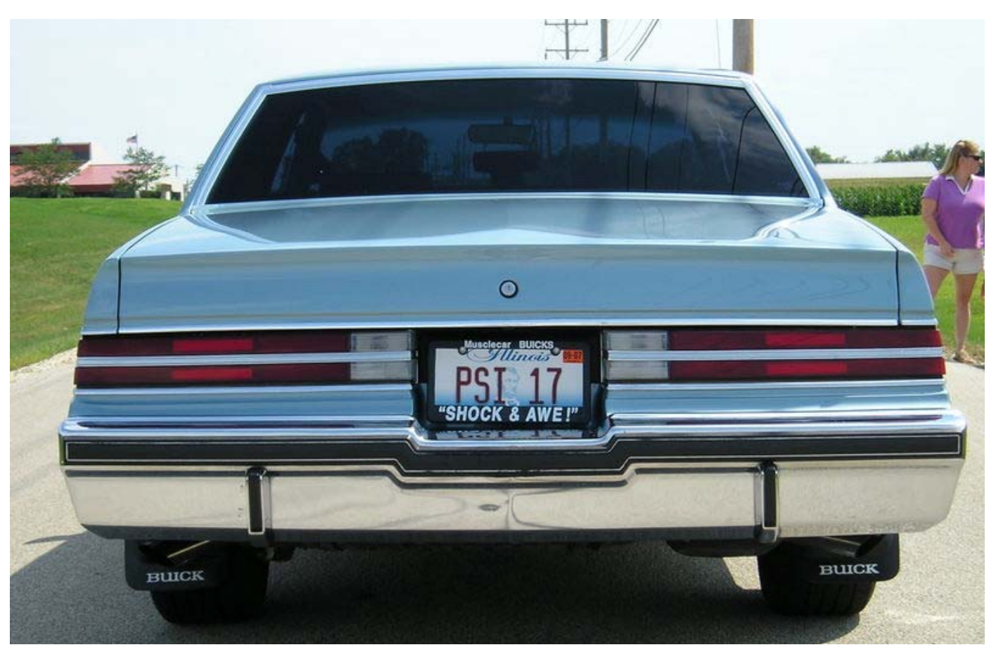
Those not familiar with innocent looking Turbo Regals will probably see this

Originally, the paint job was supposed to be one of those "fix it up quick" deals, but it became one of those "make it gorgeous" paint jobs instead. Mark patched the minor rust in the quarter panels and fixed a hole in the floor. The passenger's door was replaced and the driver's door was patched. Steve went through countless 320 grit sand papers stripping every square inch to bare metal with a DA orbital sander, and Mark went over it all with body filler and elbow grease to make it super straight. Special care was also given to the rear window pillars to make sure they would never crack the way so many G-body cars do. Brand new GM weatherstripping and a new Jax custom leather interior finished off the