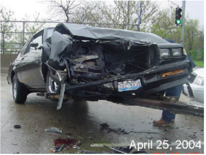
Continued on page 3

My first attempt at racing the car was a 14.97 at 91 mph. My goals set at that time was to have a reliable street car that would turn low 12's with 16 pounds of boost. It took four years to reach my goal but I finally had my car set up the way I wanted. My best time was a 12.26 at 109 mph with only 16 pounds on the meter. I was happy, everything was perfect, until Sunday morning April 25th of this year. My wife and I were on our way to a car show when a driver of a delivery van fell asleep at the wheel and crossed over into our lane. We were hit head on. The car was gone, but because we both were wearing our seat belts our injuries were minor.