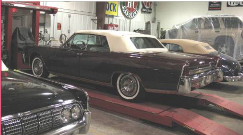
Flawless '65 Continental hides a '48-49 Caddy with late-model V-8 installed

There was a Model A, a '57 Eldorado, several late '50's Fords, 2 Continentals, and even a few late-model cars undergoing work. Yes, late model; the shop takes on additional jobs to help pay the bills.