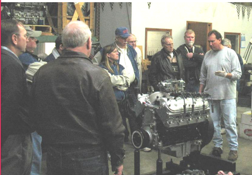
Borowski Tech explains the operations performed on the race engine to the Chicagoland members.

itself off the floor—and made the operator standing a few feet away rather nervous.