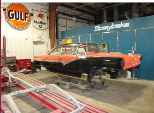
'56 Ford separated from its frame (in the foreground) This was an older, amateur restoration getting upgraded. The nice body hid a frame weakened by rust.

Cars and frames are chemically stripped at an outsourced vendor, then brought back for all necessary metal shaping and welding. Frames are powder coated. Primer is sprayed with the body on a rotisserie to ensure complete coverage. Bake-oven spray booths are used to finish coat. The shop has a well-equipped paint mixing and color-matching setup.