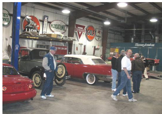
CCBCA visitors roamed freely and posed plenty of questions to the helpful staff.

Carriage House Automotive Restorations 22002 S. Howell Drive, New Lenox, Illinois 60451 Phone 888-485-6645 email : carriagehauto@sbcglobal.net