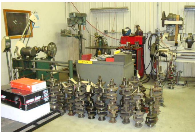
Cranks lined up in front of the balancing machine

The dynamometer room was shown, but unfortunately the dyno was not running because a customer's engine that was slated for the dyno run was taking down and rebuilt with larger connecting rod bolts per the customer's request. The technician said that the dyno can handle up to 1800 HP, but when an alcohol race engine of nearly that horsepower was run, it nearly lifted