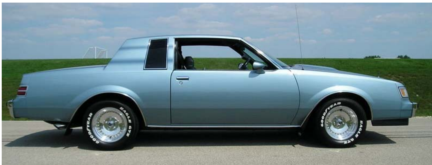
Julie Dickerson's 1987 Turbo Regal

Volume 14 Issue 1 Spring 2008 Chapter of the Gran Sport Club of America ; 625 Pine Point Circle; Valdosta, GA 31602 912-244-0577